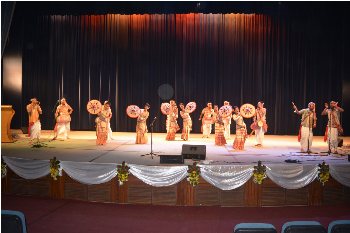
Figure 5. Bihu, a traditional folk dance, performed during the Cultural Program