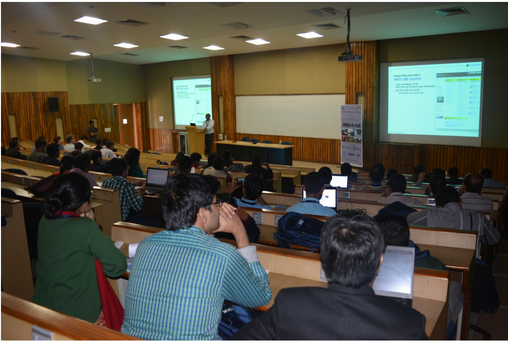
Figure 9. Presentation in a regular session